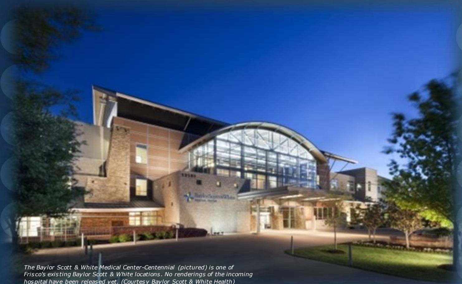
The Baylor Scott & White Medical Center-Centennial (pictured) is one of Frisco's existing Baylor Scott & White locations. No renderings of the incoming hospital have been released yet.